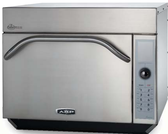
Model AXP20 shown

15 times faster than conventional ovens.