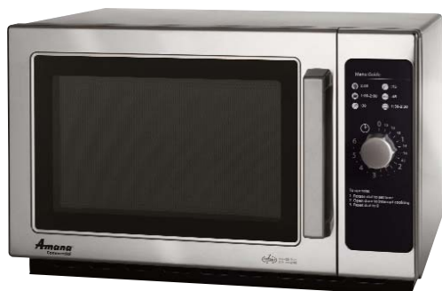
Model RCS10DS shown