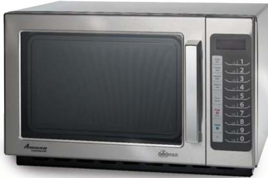
Model RCS10TS shown