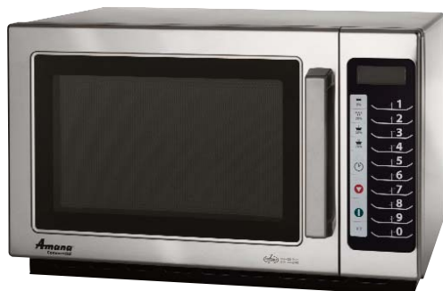
Model RCS10TS shown