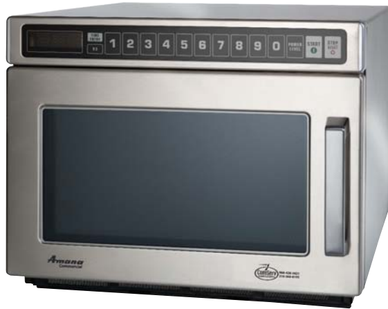
Model HDC12A2 shown