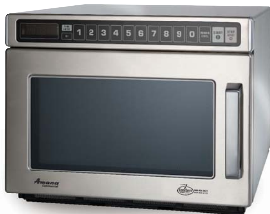
Model HDC212 shown