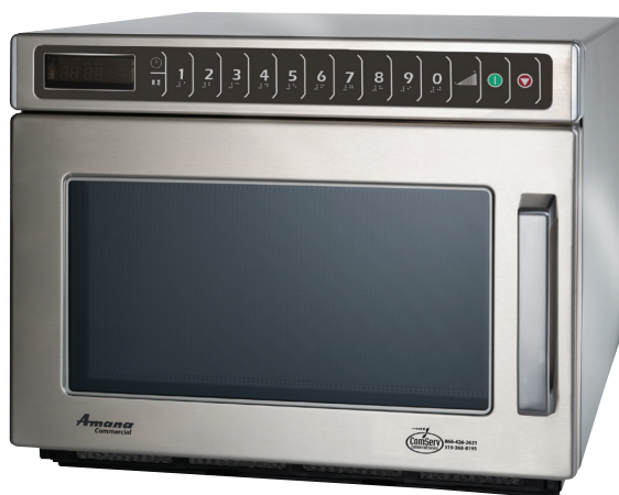
Model HDC212 shown