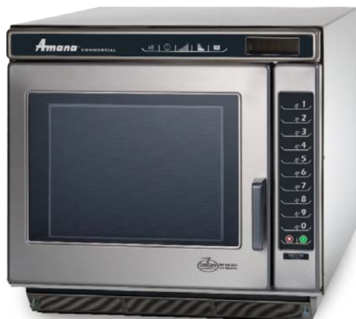
Model RC22S2 shown