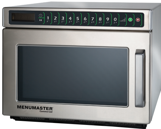
Model MDC182 shown