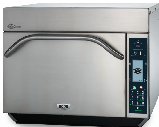
Model MXP22 shown

15 times faster than conventional ovens.