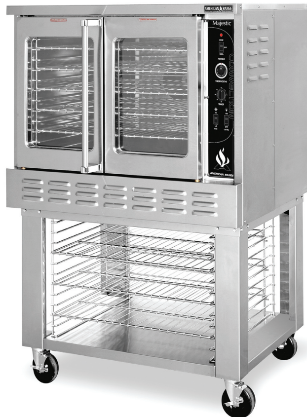
Shown with optional glass door & computerized control

American Range presents a new series of heavy duty majestic convection ovens. All stainless steel exterior construction for robust durability. Unique oven cavity baffle system provides maximum efficiency. Large size oven cavity is designed to accommodate full size sheet pans front to back or side to side. 5 racks with 12 positions allow for maximum capacity along with enhanced flexibility. Stainless steel burners w/75,000 & 90,000 BTU/hr. provide rapid heat and recovery. Two 40 watt oven lights provide improved visibility of the interior. Designed and built to provide superior performance and durability.