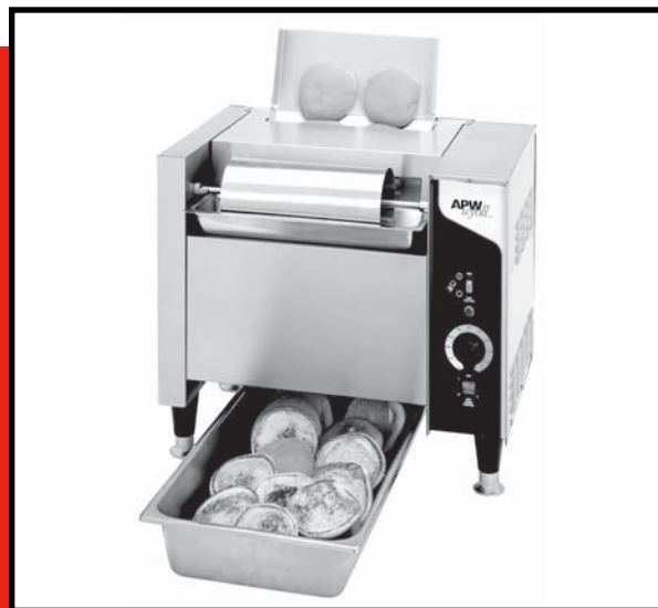
MODEL M-2000 BUN GRILL TOASTER