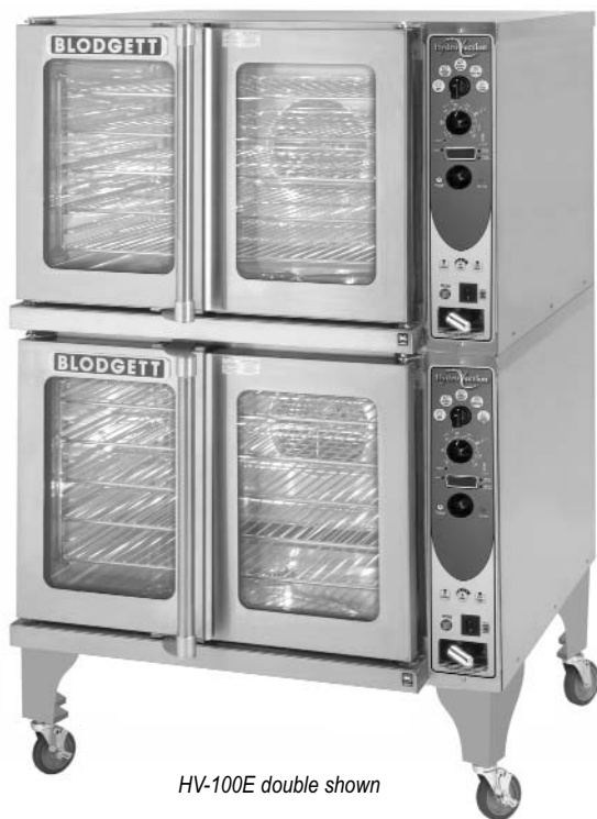
HV-100E double shown