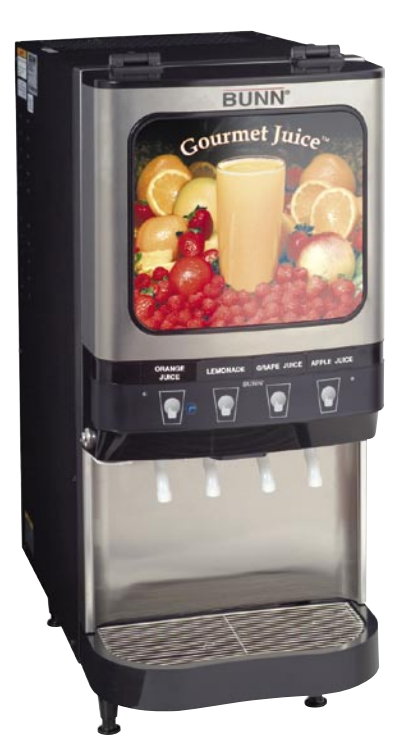
Model JDF-4 Dimensions: 35.3"H x 15"W x 27.4"D (89.5 cm H x 38.1 cm W x 69.6 cm D)