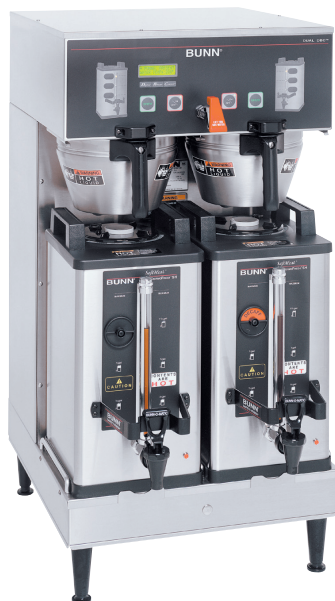
Model Dual SH DBC 1.5 gallon SH Servers* (servers sold separately)

Dimensions: 35.8" H x 18" W x 21.2" D (90.9cm H x 45.7cm W x 53.8cm D)