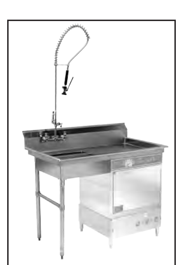
Optional dishtable, faucet and pre-rinse unit sold separately.