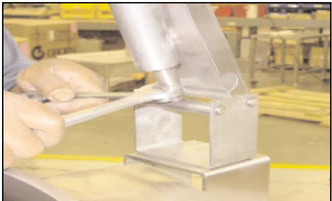
12. Adjust tension in actuator assembly by turning adjusting nuts. Use two 3/4" open end wrenches.