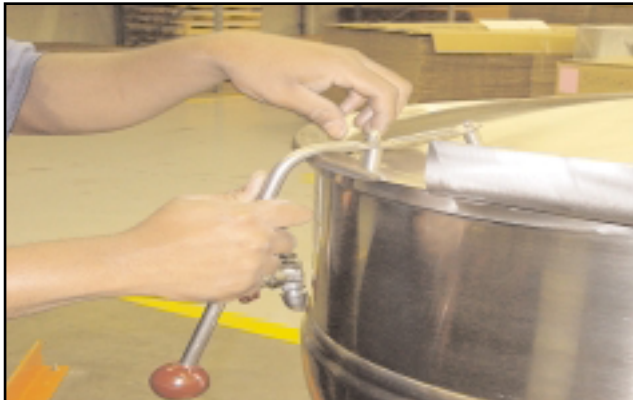
11. Tighten nuts to 20 in.-lb. with a 1/4" open end or socket wrench.