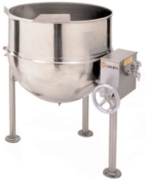
DL Model Shown