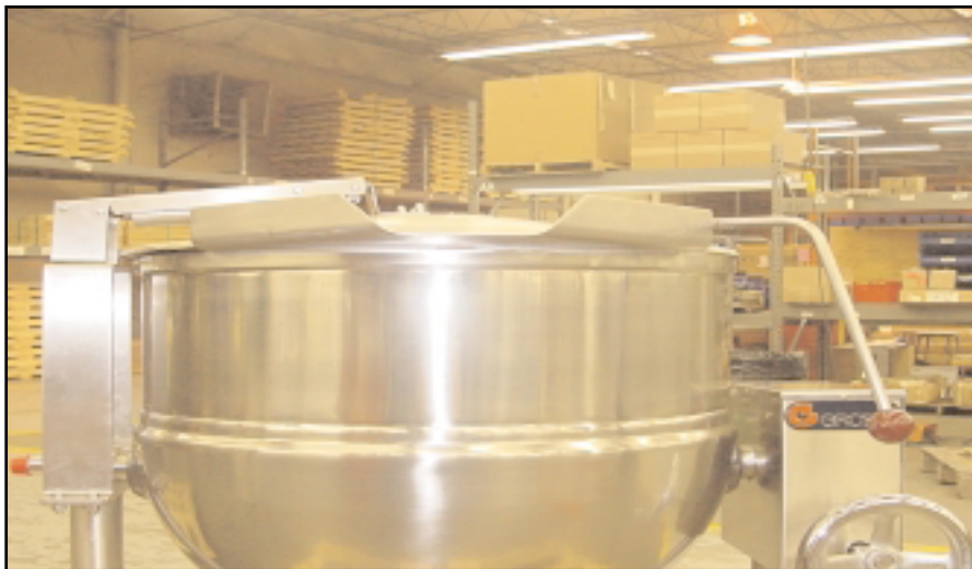
13. Completed assembly should look like the photo above.

Loctite® is a registered trademark of the Henkel Loctite Corporation.