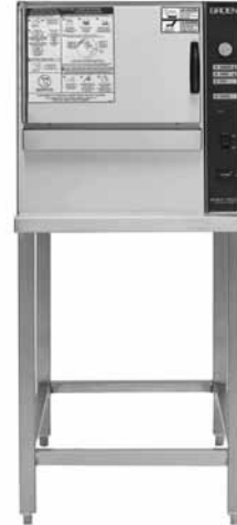
Model SSB-3EF shown

temperature of approximately 212° F. The high-efficiency steam generating reservoir shall have water level sensors. Gas heater shall have infrared burners with a firing rate of 54,000 BTU/hr.