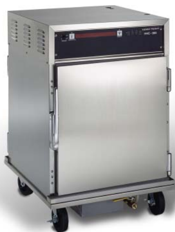
Humidified Holding Cabinet Model HHC-983 featuring digital humidity control. Holds 5 sheet pans on L or C profile runners.