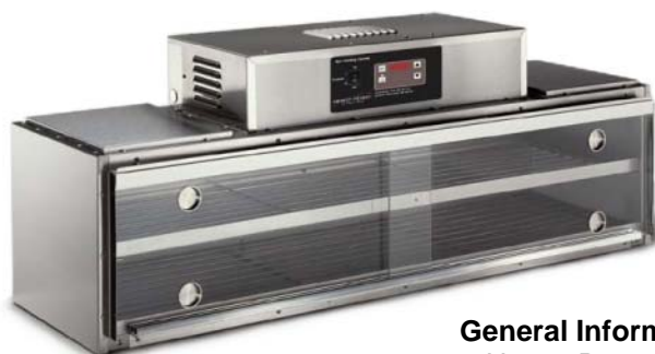
Model BW-4 two-shelf bun warmer with capacity for 4 pans per shelf.