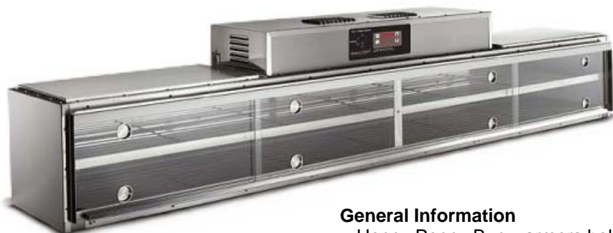
Model BW-8 two-shelf bun warmer with capacity for 8 pans per shelf.