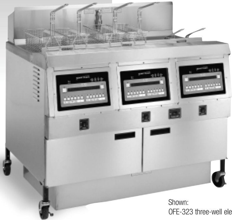
Shown: OFE-323 three-well electric

These compact, high volume open fryers are designed for greater efficiency, faster cycle recovery time and simpler programmable operation.