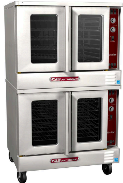
(SLGS/22SC shown with optional casters)

SLGS/22SC, SLGS/22CCH SLGB/22SC, SLGB/22CCH