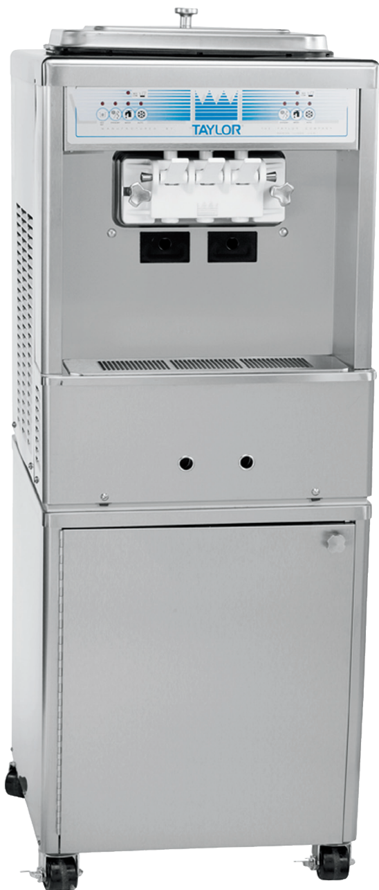
Photo shows Model 161 with optional cart