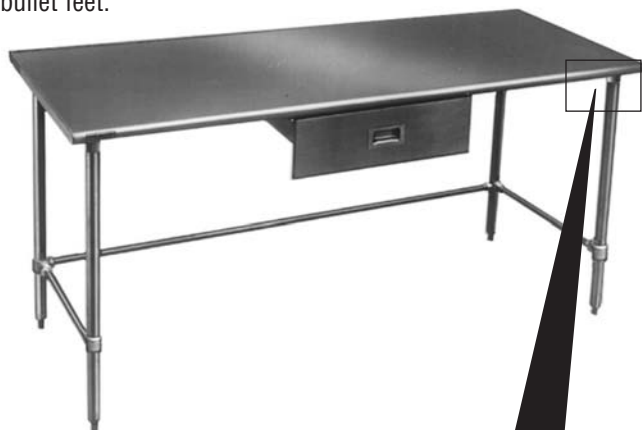
worktable with flat top and tubular base —shown with optional drawer

Eagle worktables, Deluxe series, model _____. Top to be constructed of 16/304 stainless steel with 1½" roll on front and rear, and sides turned down 90°. Open front with 1¼" O.D. stainless steel tubular crossbracing on sides and rear. Top reinforced with welded hat channels and sound deadened. Constructed with uni-lok® patented gusset system with the gussets recessed into the hat channels to reduce lateral movement. Legs to be 1½" O.D. stainless steel tubing, with stainless steel gussets and 1" adjustable hi-impact plastic bullet feet.