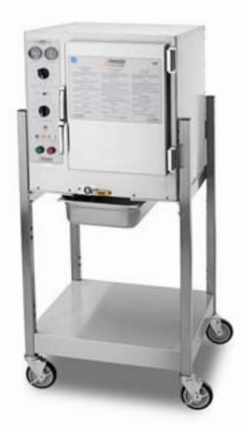
S6 Stand Mounted Steam'N'Hold™ Steam Cooker with optional 4" drain pan