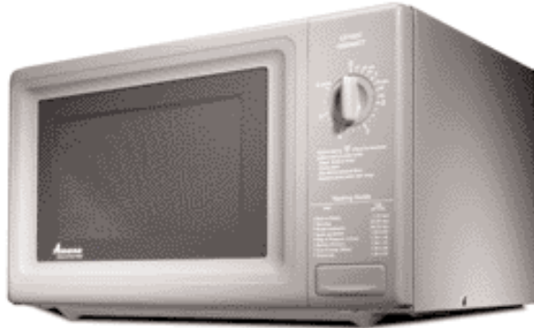
Model LD10D2 shown