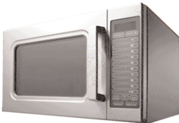
Model ALD10T shown