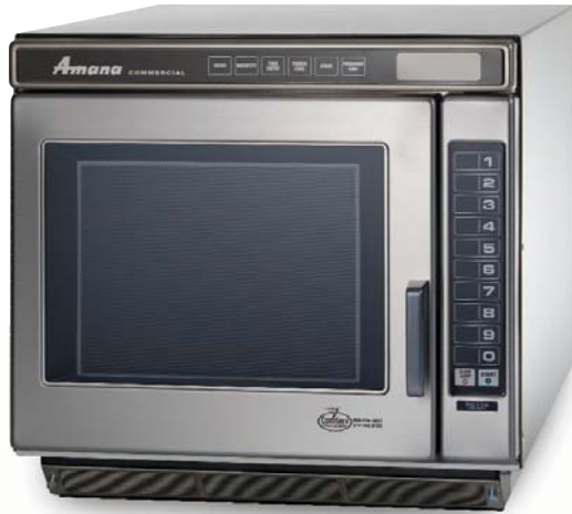
Model RC17S2 shown