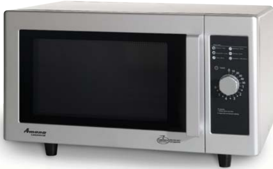
Model RMS10D shown