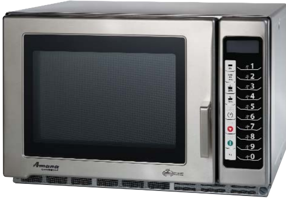
Model RFS12TS shown