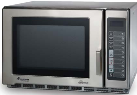
Model RFS18MPS shown