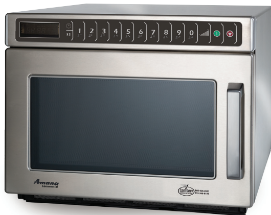
Model HDC182 shown