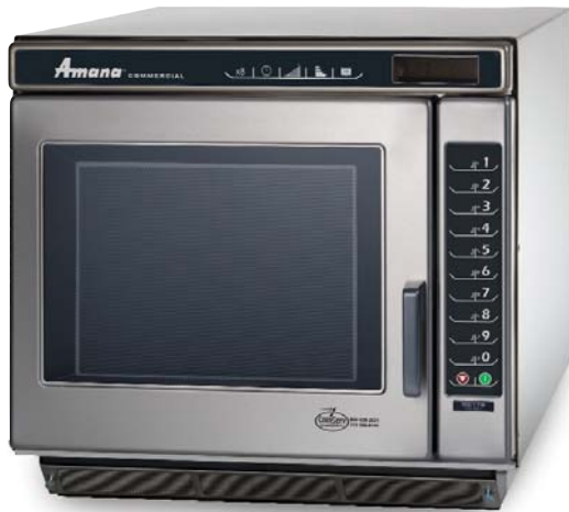
Model RC17S2 shown