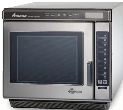
Model RC22S2 shown