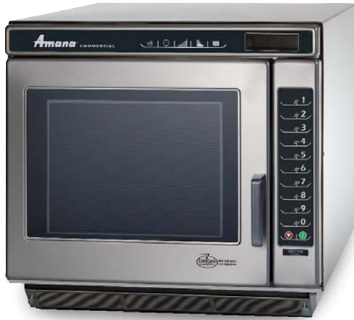
Model RC30S2 shown