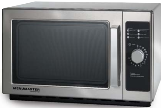
Model MCS10DS shown