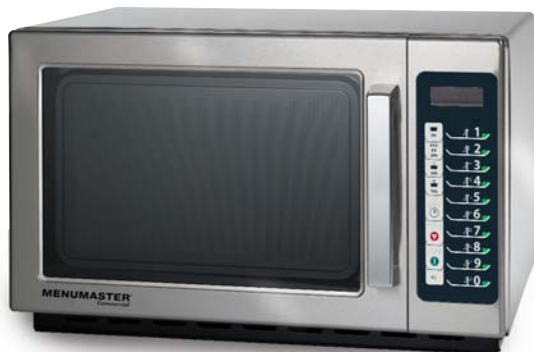
Model MCS10TS shown