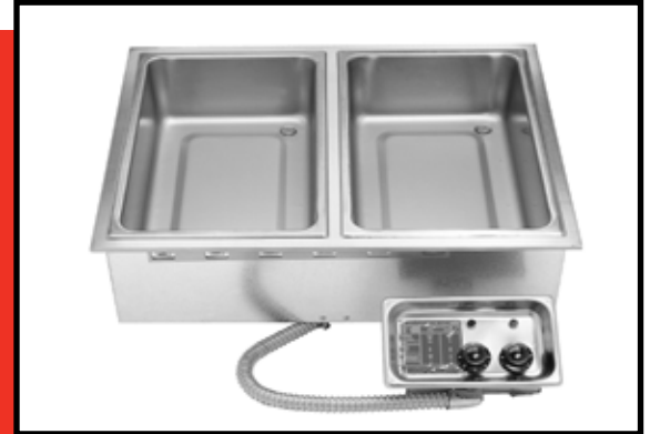
Top Mount w/EZ-Lock