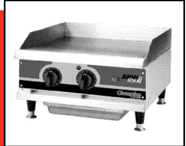
Model EG-24H Electric Griddle