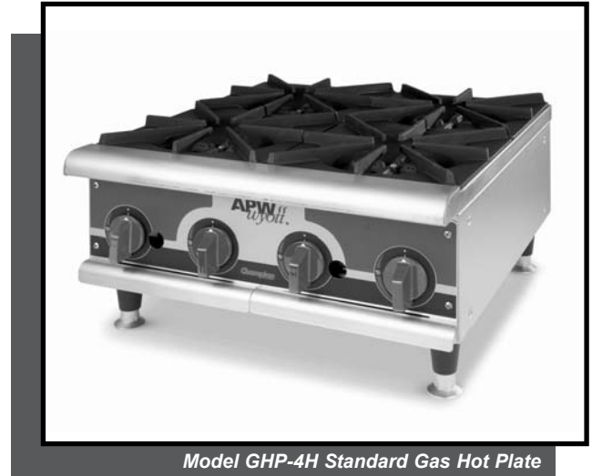
Model GHP-4H Standard Gas Hot Plate

*Warranty does not include cooking grates or fireboxes