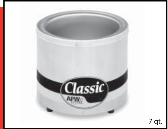
MODEL RW-1V COUNTERTOP ROUND WARMER