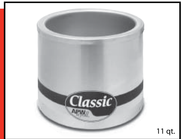
MODEL RW-2V COUNTERTOP ROUND WARMER