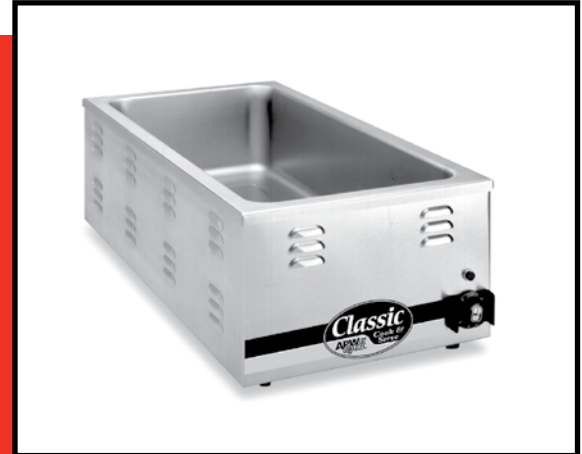
MODEL W-43V COUNTERTOP WARMER