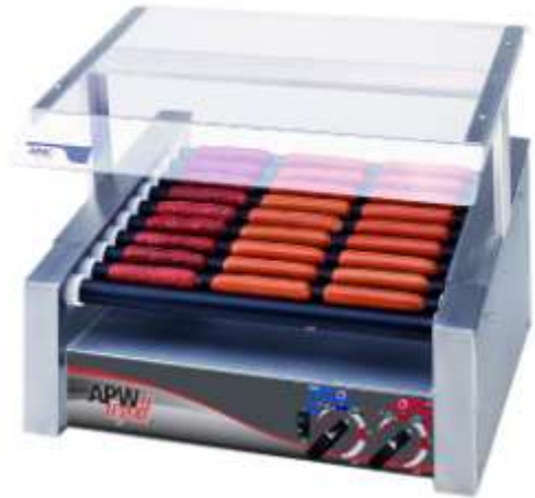
Model: HRS-31S Roller Grill with SGXP-31 Sneeze Guard