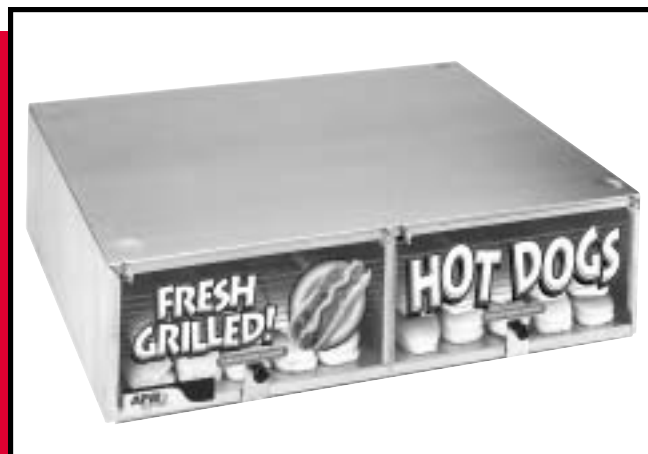
MODEL BC 31