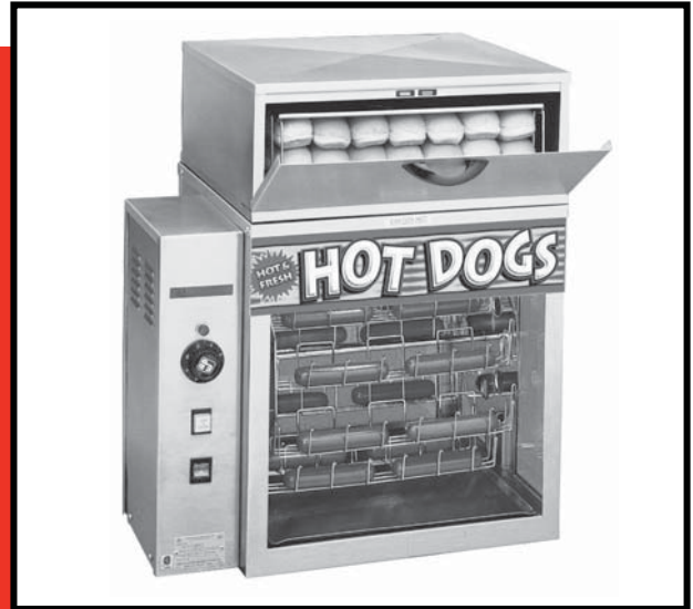
MO DEL DR-2A HOT DOG BROILER ITH OPTIONAL BH 1A BUN HOLDER

* Please note: DR-1A and BH-1A are listed with UL, NSF and CSA as individual components only, not as the DR-2A package.