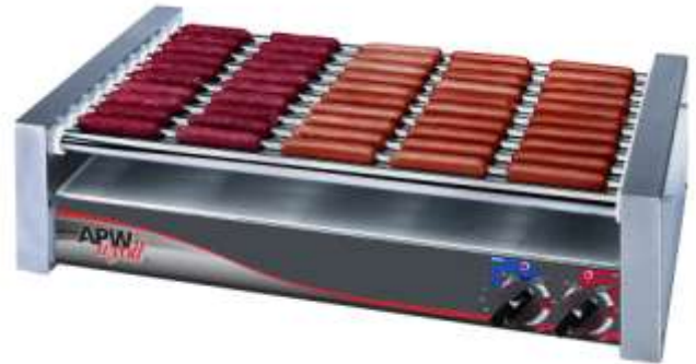
Model: HR-50 Roller Grill