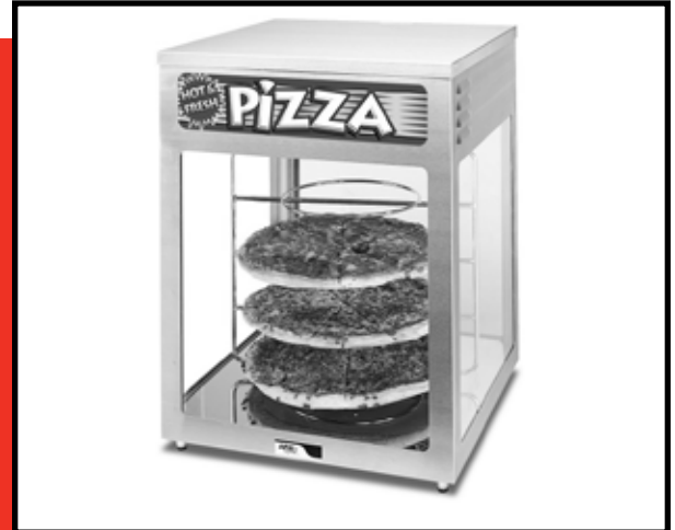
HDC-4 Heated Display Cabinet