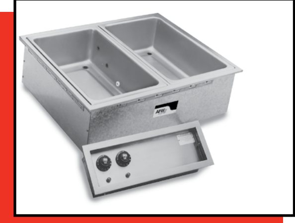
Insulated EZ-Fill Hot Food Well (SHFWEZ-2)