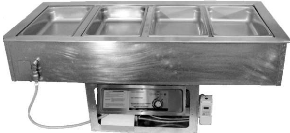
(Model CHDT-4 Shown)